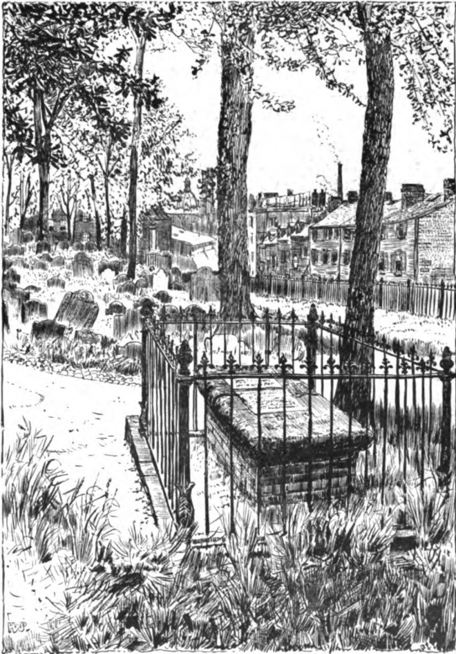
The Mather Tomb.