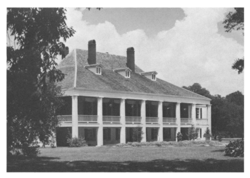
Destréban Plantation, scene of the trial of slaves involved in the 1811 uprising.

Jupiter (the property of Manuel Andry), replied simply "to kill the white" ("détruir le Blanc").<sup>29</sup>