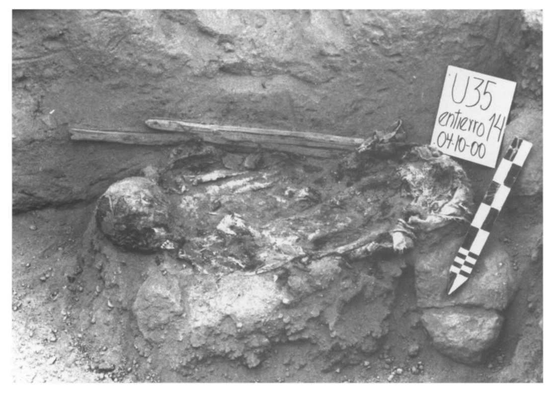
Figure 9. PSI 9 in situ in the constructive fill of the Temple of the Monkey.

human sacrifice appears to have served different functions at different times and in different cultural groups.