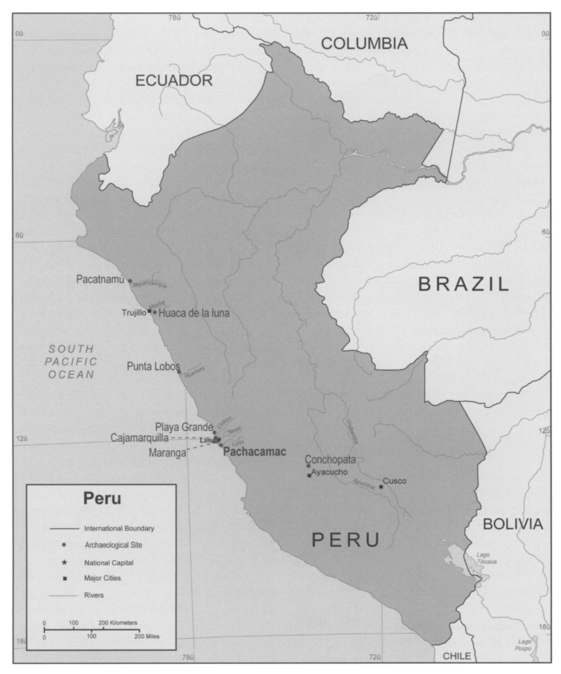
Figure 1. Map of Peru with sites mentioned in the text.

teenth century (Bueno Mendoza 1982; Eeckhout 1999a; Shimada 1991; Uhle 1903). The Ychsma Project (Université Libre de Bruxelles, Belgium— Instituto Nacional de Cultura del Peru) started in 1999. It is a long-term, multidisciplinary project, which aims to understand the function, development, and influence of Pachacamac during the Late Intermediate Period and Late Horizon. While there