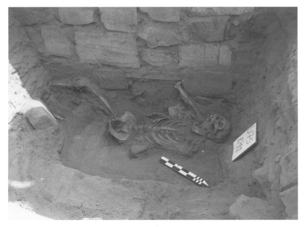
Figure 4. PSI 1 in situ.

come from the same general sector of the site: the periphery of the Central Plaza. It is worth describing this sector since this helps to understand its importance and perhaps the presence of the PSIs. The North-South Street that permits external access to the site terminates at the entry of the Central Plaza (Figure 2), giving rise to a three-way junction: straight on to enter the Central Plaza, to the left through the Eastern Corridor (toward the Southeastern part of the site), and right through the Western Corridor all along the exterior side of the Central Plaza, leading into the famous Pilgrim's Plaza. The huge corridor walls are made of irregular stone blocks with tapia basements. This peculiar circulation layout was designed by the Incas in order to control the flux of visitors to the site during the Late Horizon (Eeckhout 2004d, 2008).