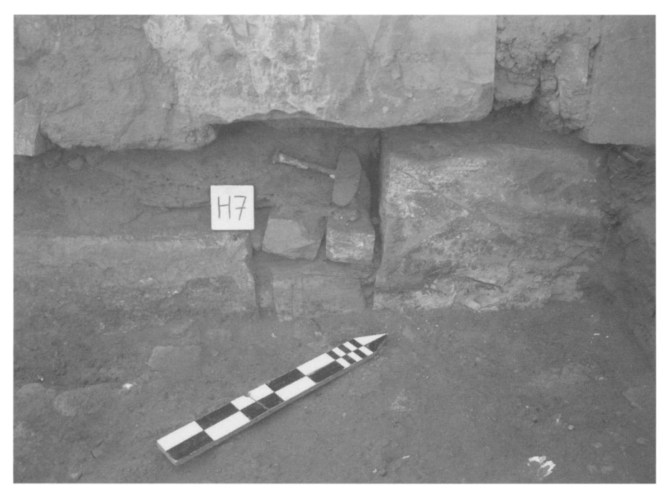
Figure 6. Sacrificial knife in a cache near PSI 2.

to the left parietal. Although these individuals obviously died from a violent death, similar to PSI 1 and 2, the disturbed nature of the context does not permit us to discard nonritualized murder or lethal battle injuries as possibilities.