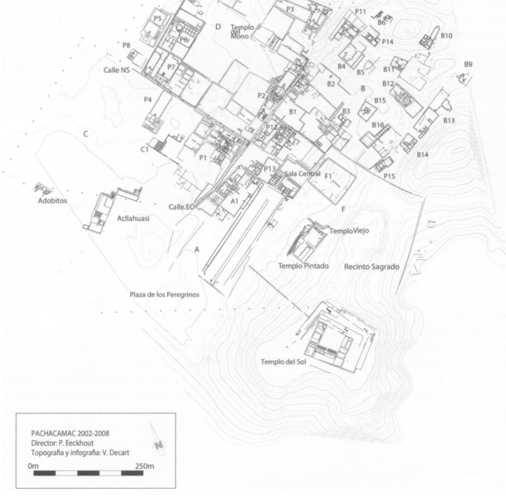
Figure 2. Map of monumental area of Pachacamac (2008) with complete nomenclature of buildings (Dir: Peter Eeckhout; Topographer : Valérie Decart).

locale to study all aspects of bioarchaeology, including sacrifice, evidence for which has been recently recovered at the site.