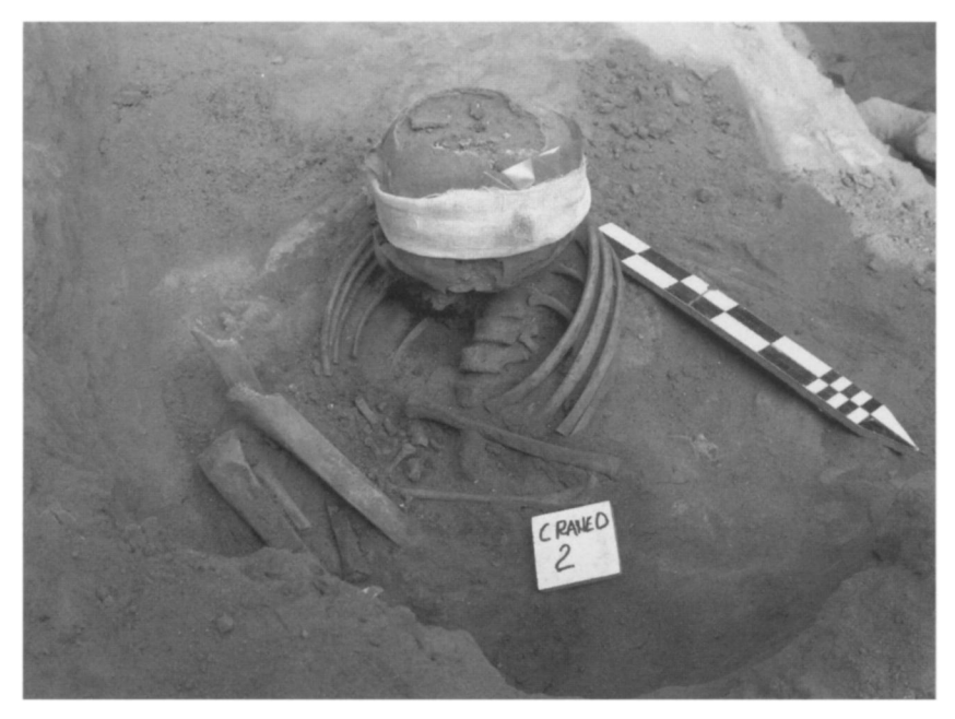
Figure 5. PSI 2 under excavation (the skull has been consolidated with bandages).

very beginning of the Spanish Conquest (when the Pachacamac Idol was destroyed, its cult prohibited and the population forcefully moved to the Rímac Valley to construct Ciudad de los Reyes [Cobo 1964 (1653), II:285–286]. It should be noted that the test pit in which PSI1 was encountered measured only 4m<sup>2</sup>, so that it is possible that further similarly deposited individuals may be found nearby.