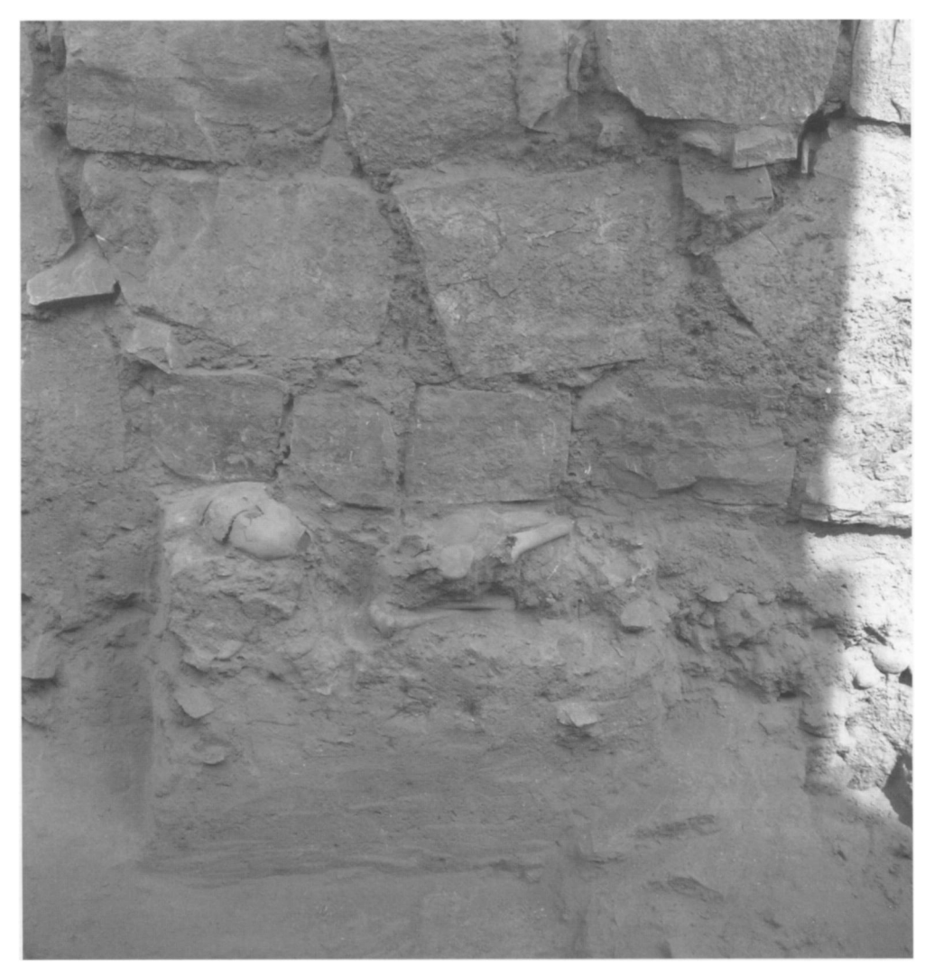
Figure 7. PSI 7 in situ under the lower course of a wall of the Western Corridor.

Incas performed a series of child sacrifices. This would be consistent with the archaeological evidence, and also resonates with ethno-historic records (see below).