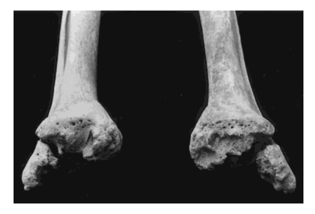
Figure 3. Distal ends of tibiae and fibulae, Case I (anterior oblique view).

placed in architectural fill below an intact layer of adobe bricks. Few grave offerings were found with these individuals, suggesting that they were of relatively low status, despite their location close to the platform. No offerings were found in Tomb 4 (Franco et al. , 1995).