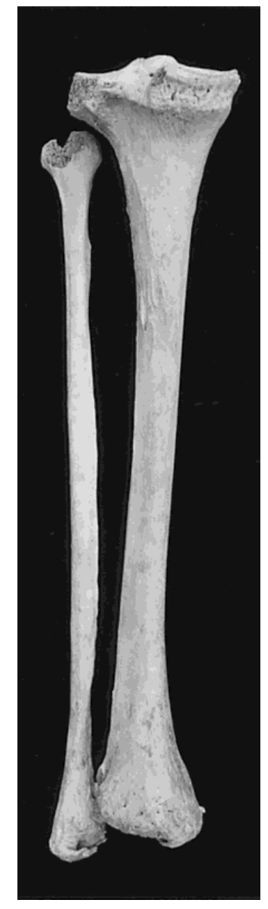
Figure 5. Left tibia and fibula, Case II (posterior view).

All foot bones are absent. The distal tibiae and fibulae show non-functional joint surfaces,