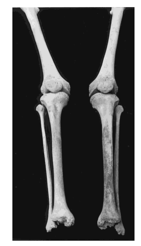
Figure 2. Articulated leg bones of Case I (anterior view).

Tomb 4, excavated in 1995 from a unit on the west side of one of the two major adobe platforms at El Brujo (Huaca Cao), contained the complete skeleton of an adult male, with the exception of the bones of the feet. The burial was one of four individuals—two adult and two adolescent males—found in simple graves