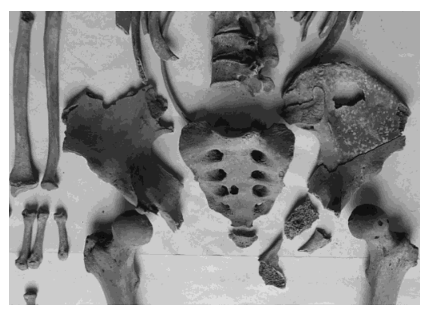
Figure 7. Bones of the pelvic area of Case III, showing age and sex indicators.