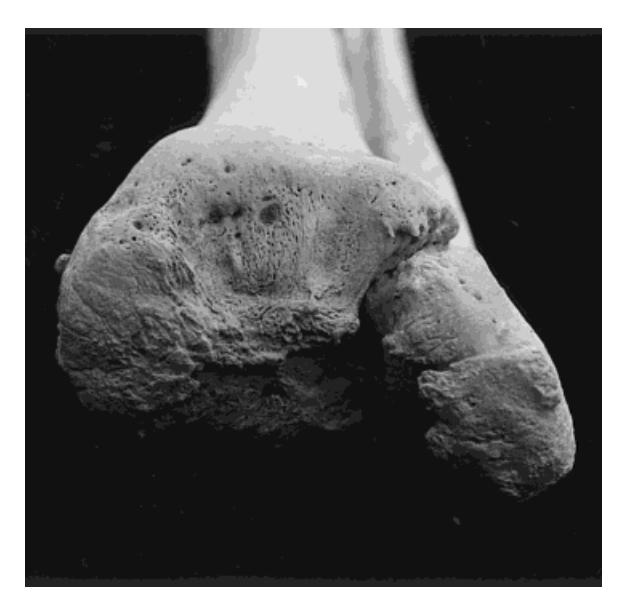
Figure 6. Distal ends of left tibia and fibula, Case II (anterior oblique view).

This specimen consists of the associated left tibia and fibula of an adult male. The bones were recovered from the fill of a disturbed high status chamber tomb within the Huaca Cao