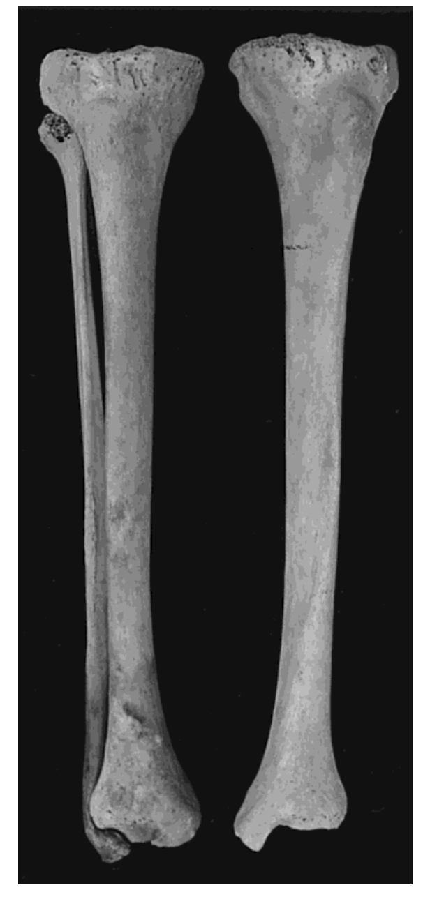
Figure 8. Right tibia and fibula compared with left tibia, Case III (anterior view).

ceramic vessels showing persons with missing limbs or extremities. The most common are individuals missing both feet (> 50%), followed by those missing a single foot (26%). Less common are those missing arms, arms distal to the elbow, and hands (Table 1). Figure 11 is a representative example of a Moche ceramic ves-