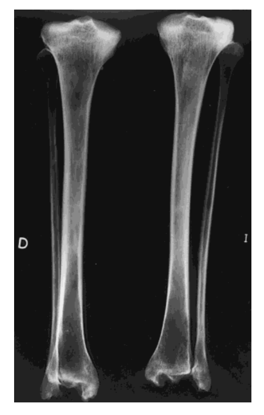
Figure 4. Radiograph of tibiae and fibulae, Case I.

Multiple skeletal age indicators, including morphology of the pubic symphysis and auricu-