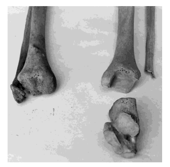
Figure 10. Right and left lower leg bones with left calcaneus, Case III.

form of ritual mutilation that marked certain individuals as special attendants to the nobility in Moche society, and in the afterlife as well (Arsenault, 1993). Whatever the function or meaning of amputation in Moche society, until recently there was little skeletal evidence to suggest that surgical amputation was actually performed.