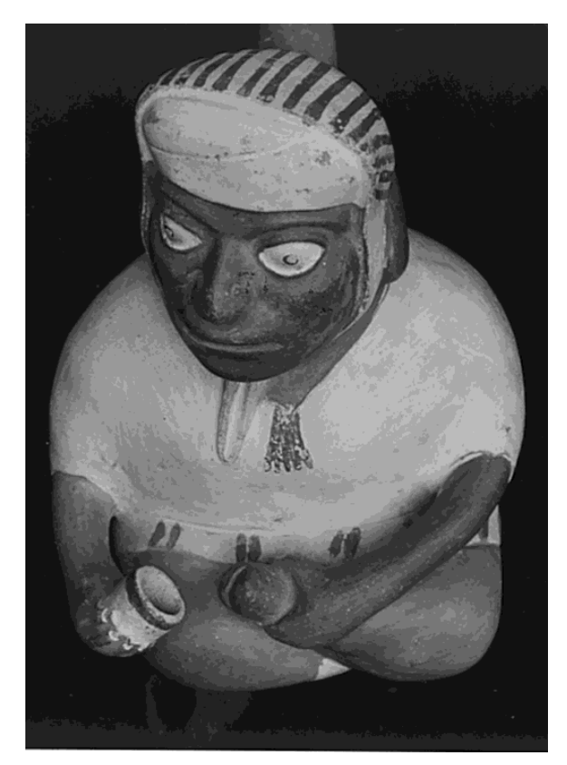
Figure 12. Moche ceramic vessel showing an individual with a cup-like prosthesis. Courtesy of the American Museum of Natural History (Catalog # B4919).

simple wooden cups padded with wool. The tibiae were reported to be normal in appearance, with no evidence of swelling, infection, or other pathology. Vélez López concluded that the feet were not lost as a result of disease, but were intentionally amputated—probably as a form of punishment. Unfortunately, Vélez López did not publish photographs of the skeleton or prostheses. The material appears to have been in a private collection, and its present whereabouts are unknown. Nevertheless, the skeleton described by Vélez López is of great interest because it appears to present a case similar to those described in this report. Moreover, it was reportedly excavated at the archaeological site of Mocollope, where Case III (this report) was found in July of 1998.