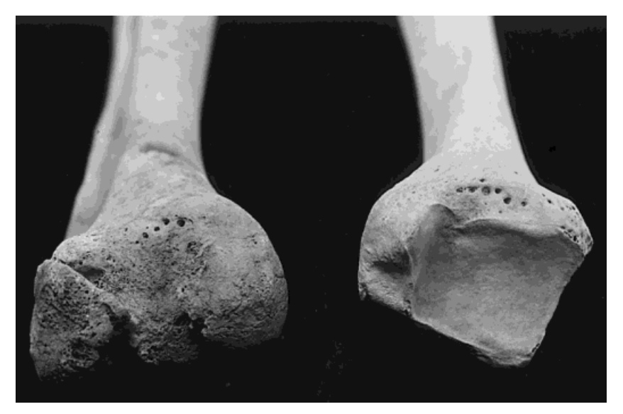
Figure 9. Comparison of right and left ankle joints, Case III (anterior oblique view).

Frostbite damage to the feet as a motive for amputation has been suggested to us, although this seems unlikely in a coastal Peruvian culture such as the Moche.