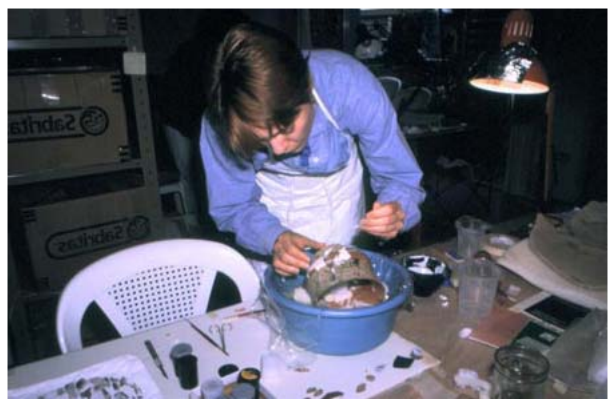
Figure 7. Restoration of a ceramic bowl.