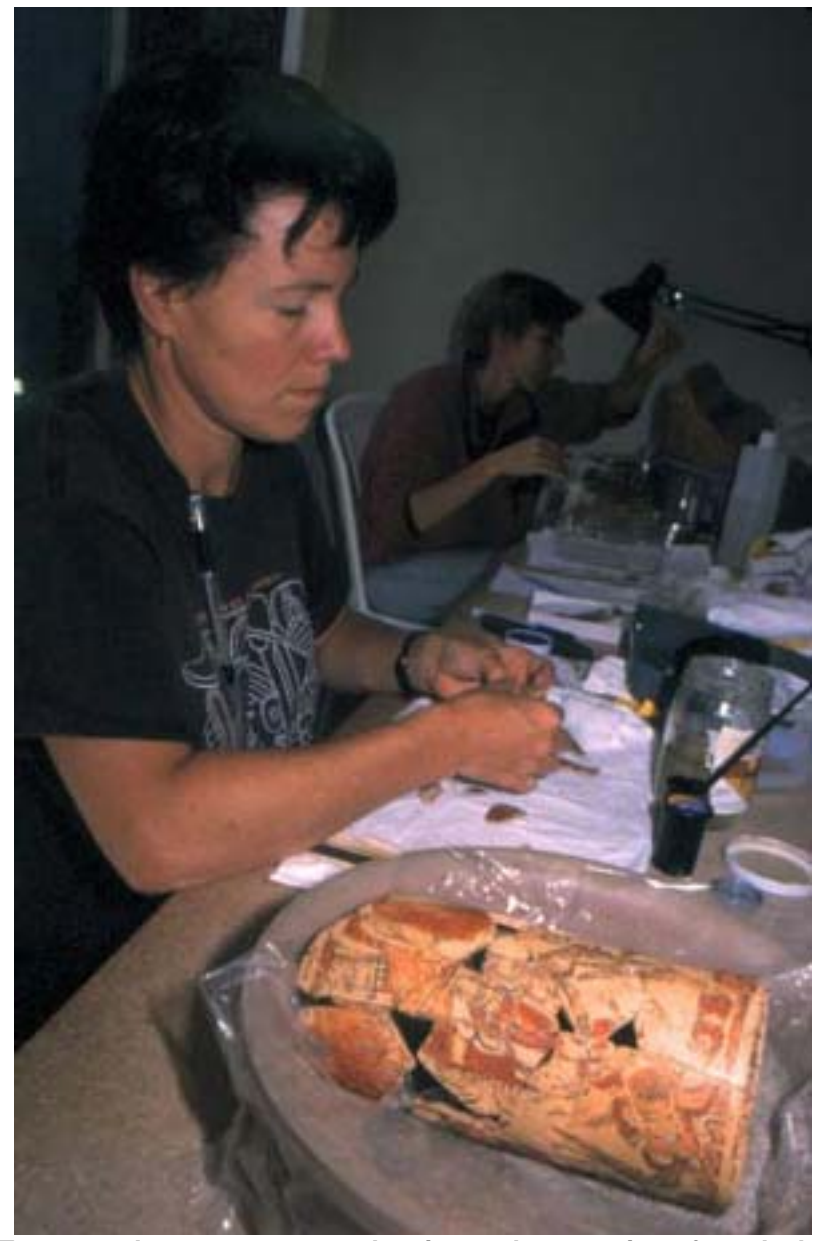
Figure 5. Treatment by conservators: cleaning and restoration of a polychrome vase.