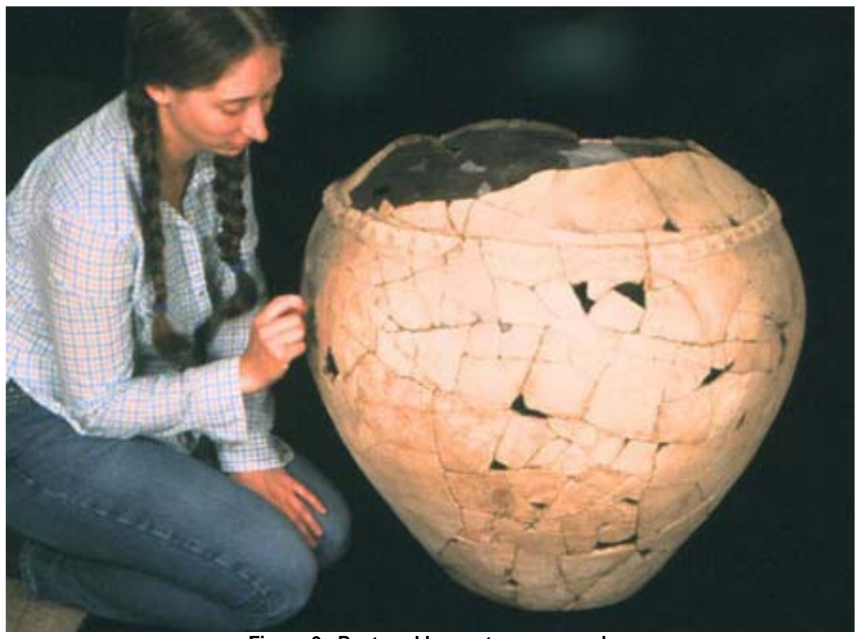
Figure 9. Restored large storage vessel.