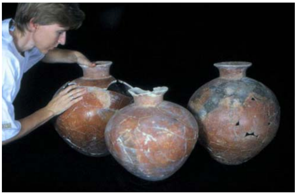
Figure 4. Restored vessels.