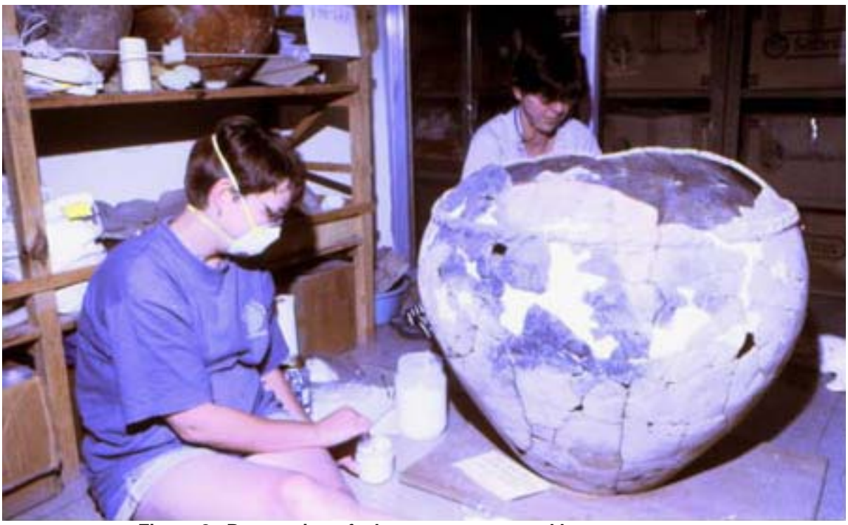
Figure 8. Restoration of a large storage vessel by conservators.