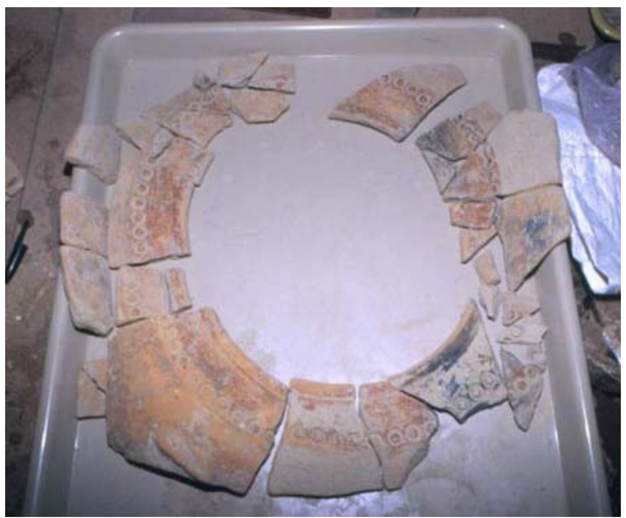
Figure 1. Restoration of a vessel: refitting of fragments.