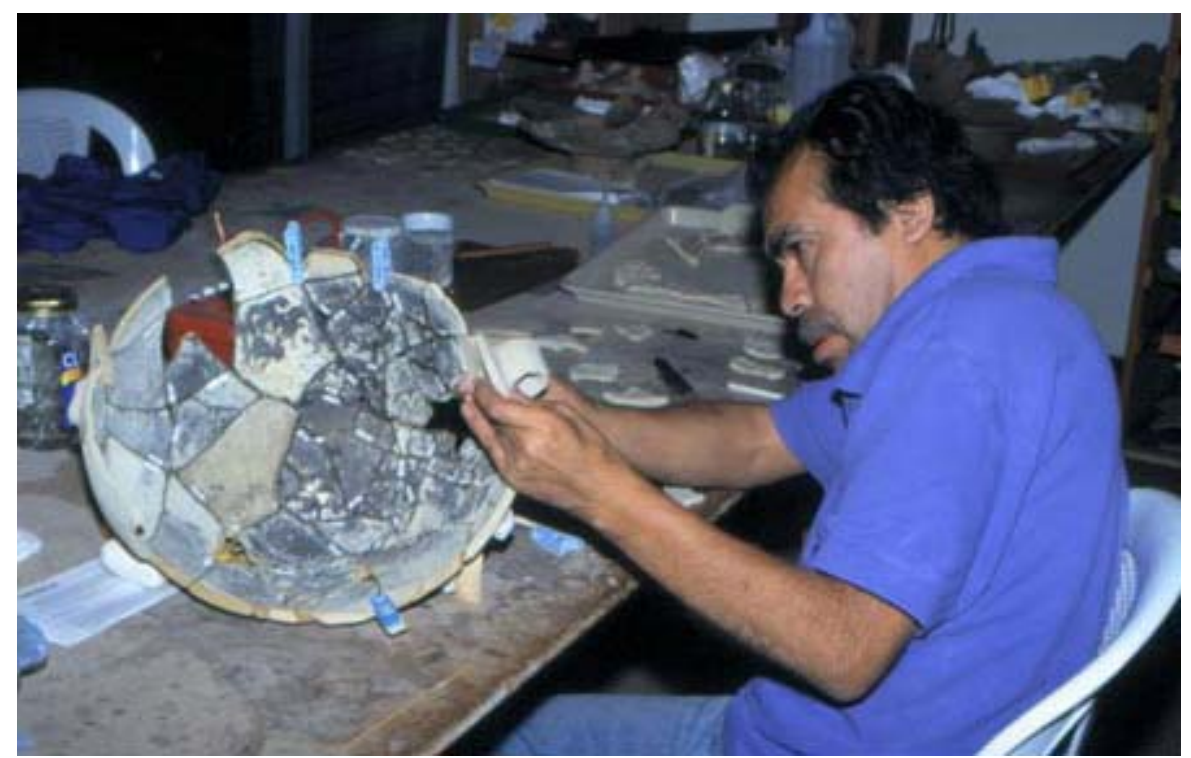
Figure 2. Gluing pieces of the bottom part of vessel.