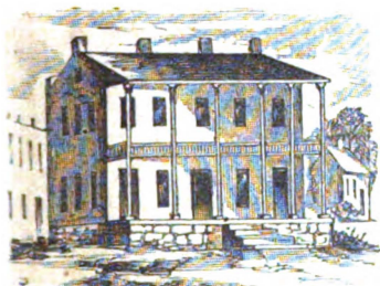
State House, Leocompton.