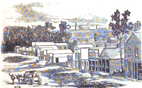
Front Street, Leavenworth City.