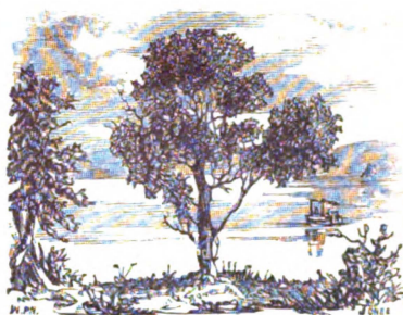
Old Elm, Leavenworth City.