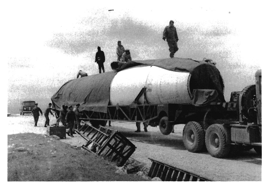
Operation POT PIE: dismantled Italian Jupiter missile being readied for transport, April 1963. The period for which the missiles were actually deployed turned out to be far shorter than the time required to deploy them.

dismantled Thors alone were more than the air force or NASA could usefully convert into space boosters, and no one else in the government was interested in the leftover Jupiters. So, the air force destroyed the missile bodies and returned the warheads, guidance systems, and mobile equipment to the United States. This attempt to reap more buck for the bang recovered multipurpose items worth only $14 million, which was, as one DOD official admitted, a disappointingly small sum.<sup>35</sup>