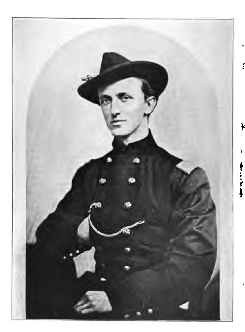
WILLIAM F. BARTLETT, Brig.-Gen. and Bvt. Maj.-Gen. U.S. Vols.