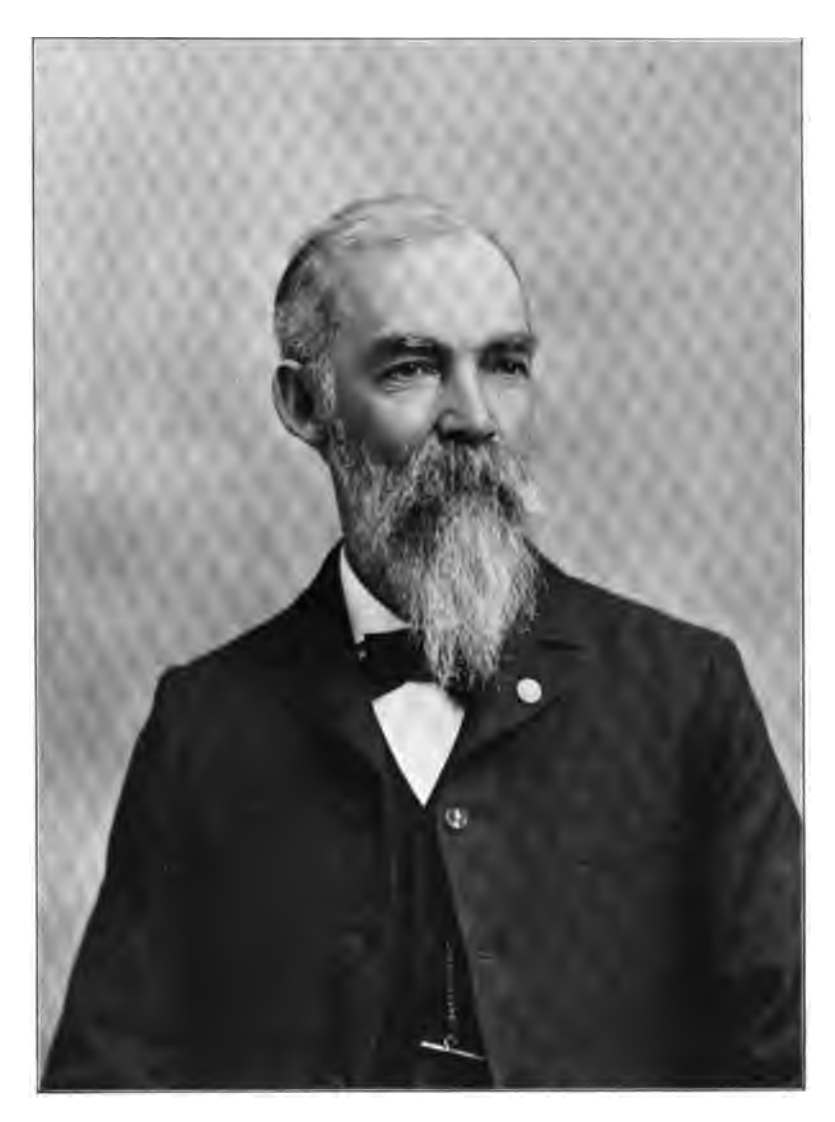
ALFRED O. HITCHCOCK, Capt. 57th Mass.: Bvt. Maj. U.S. Vols.