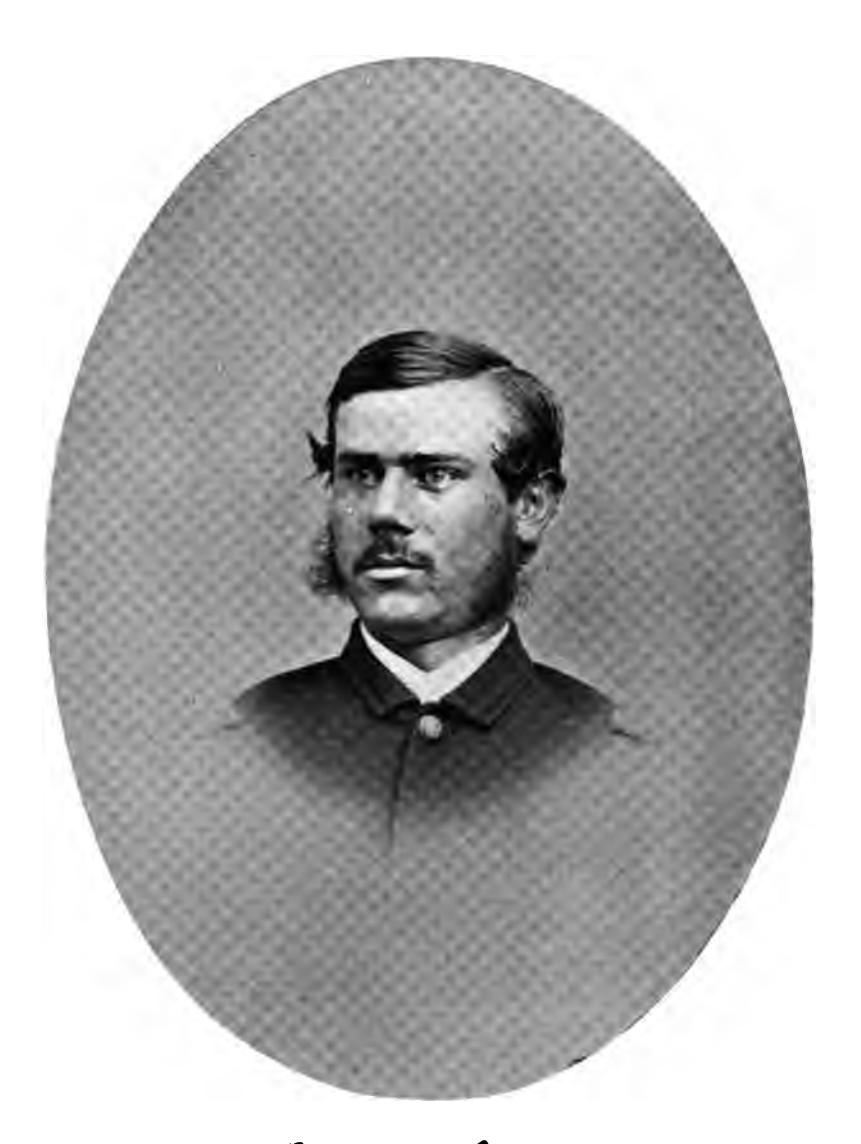
Mio. E. Prest. a.a.q.m