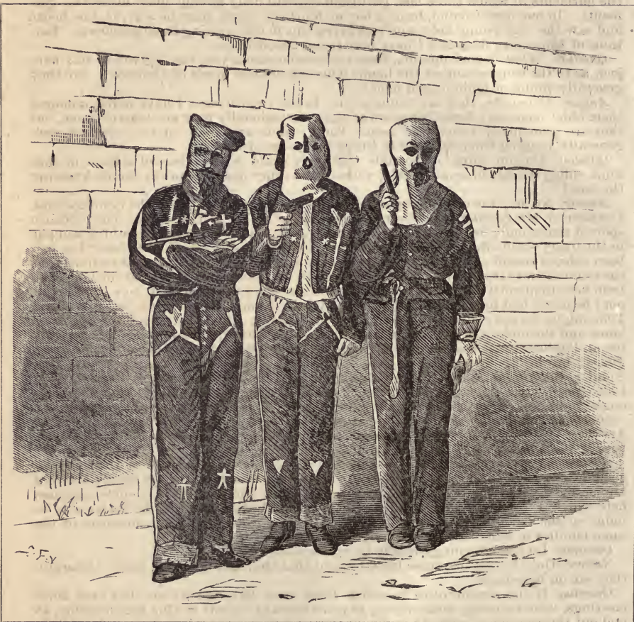
FROM A PHOTOGRAPH SUBMITTED BY HON. G. WILEY WELLS, OF DISGUISES EXHIBITED TO THE COMMITTEE.

Electrotype furnished by Harpers' Weekly, (Vol. XVI, p. 73.)