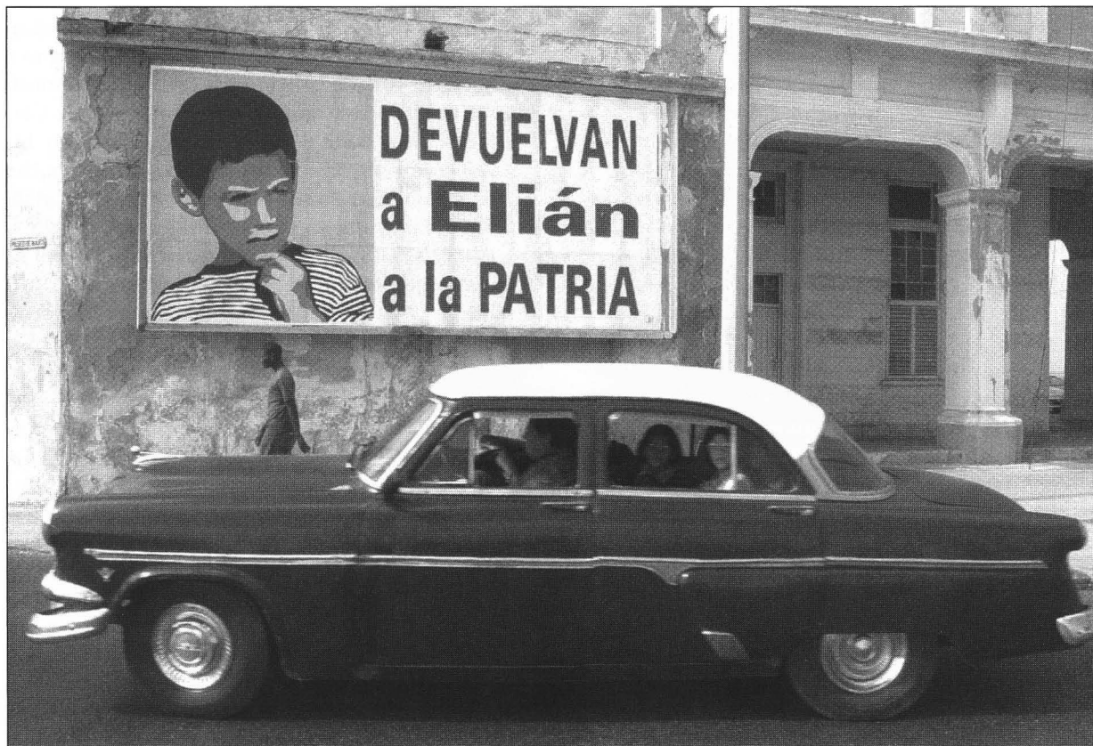
Havana taxi passing a public poster calling for Elián González's return to his homeland in early 2000.

ton, D.C., with his father, who had arrived in the capital city two weeks earlier.