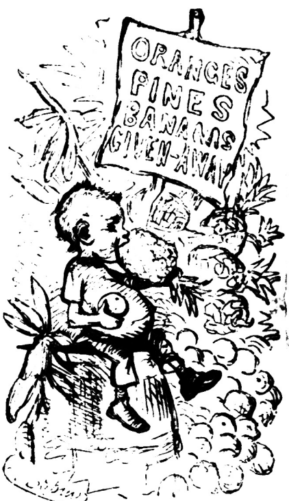
7. The Juvenile American consoles himself by feasting gratuitously on bananas, oranges, and other tropical fruits.