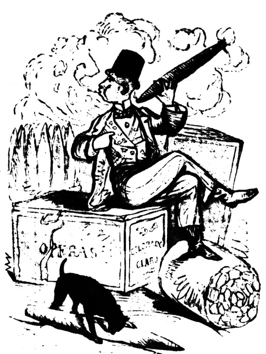
2. The first consequence of the measure is an enormous increase in the size and number of the cigars smoked by Young America.