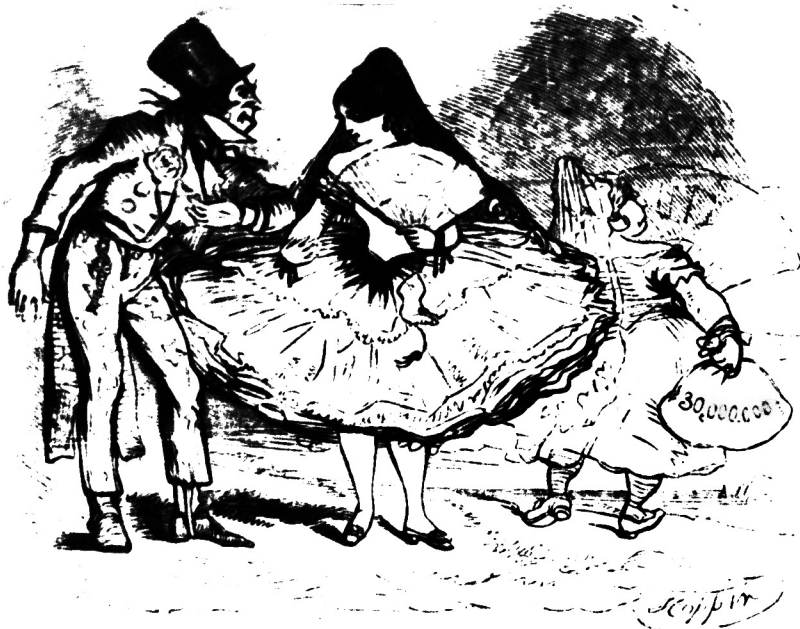
1. Brother Jonathan proceeds to annex the lovely Miss Cuba, in obedience to the laws of manifest destiny.