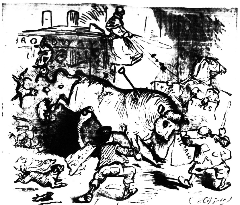
8. And New York appreciates the change when bull-fights on Broadway become an established feature of the institutions of the city.