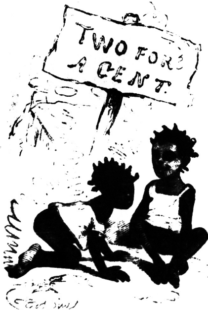
3. The market for young niggers is so tremendously affected that a couple of those interesting objects are sold for a cent, with guarantee.