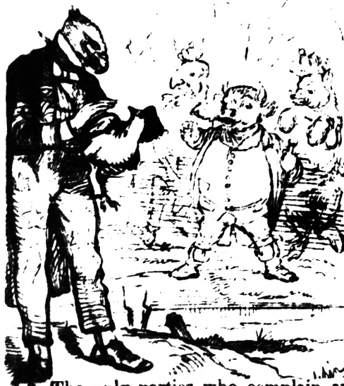
9. The only parties who complain are foreign nations, who vent their disgust in severe but harmless demonstrations.