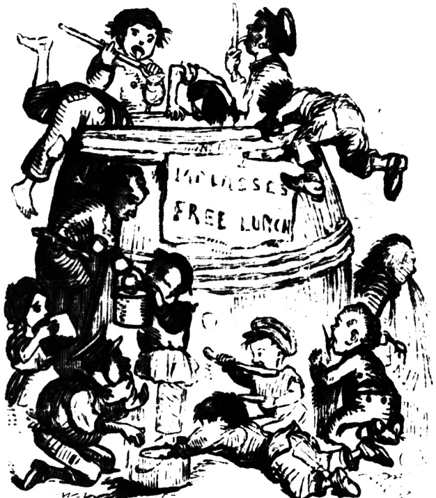
4. Sugar and Molasses becoming dirt cheap, free lunches to small boys are given by enterprising and liberal grocers.