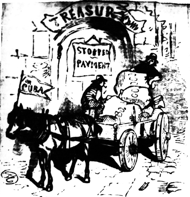
5. The United States Treasury, depleted by the transmission of $30,000,000 to Madrid, incontinently stops payment.