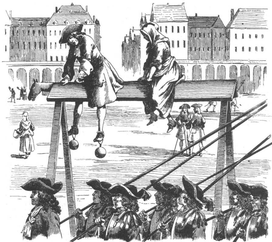
THE WOODEN HORSE AS USED IN FRANCE, ABOUT 1715

From a drawing by JOB in Henri Bouchot, L'Épopée du Costume Militaire Française (Paris, 1898).