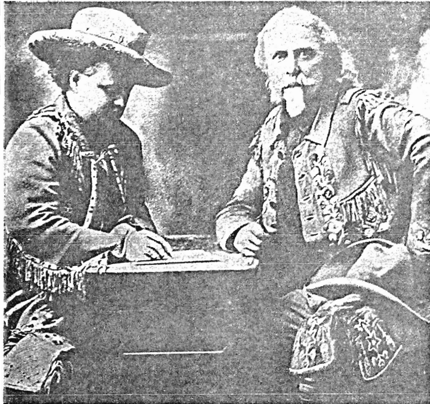
1908. Major Gordon ("Pawnee Bill") Lillie and William F. ("Buffalo Bill") Cody combine their talents and invent the greatest, most rootin' tootin' Wild West Show of them all—a sentimental picture of a frontier that never was.