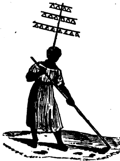
A WOMAN WITH IRON HORNS AND BELLS ON, TO KEEP HER FROM RUNNING AWAY.