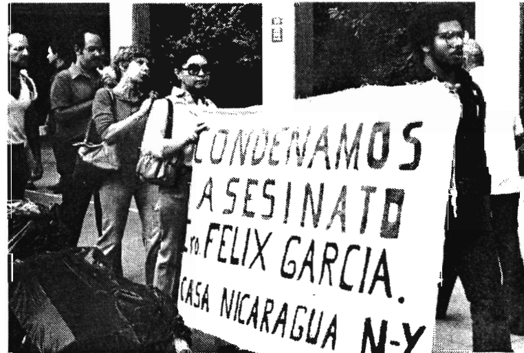
Protest at UN

This point was emphasized by the demonstrators outside the UN. A statement distributed to passers-by from the sponsoring group, the Committee to End the U.S. Blockade Against Cuba, demanded a halt to "all terrorist violence" against Cuba.