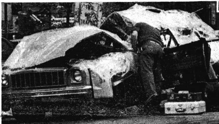
Top, 500 in New York protested killing of Cuban diplomat. Below, car blown up by terrorists in 1976 killing of Chilean leader Letelier. Killers will now get new trial.

cast in much of the news media. They wanted to turn the victim into the criminal and relieve the pressure on the government to move against the terrorists.