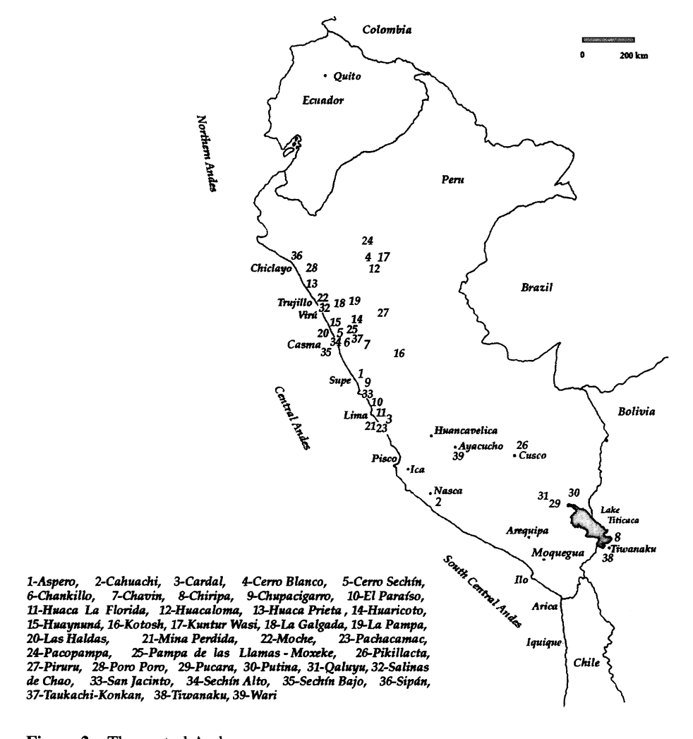
Figure 2 The central Andes.

The central Andes extends over 1,000,000 km<sup>2</sup> and includes some of the world's driest deserts, rugged mountainsides and peaks, highland grasslands, and low forests (Figure 2). At the time of European contact, the central Andes was home to several dozen distinct ethnic and linguistic groups. In spite of this diversity, the idea that the central Andes is culturally unified and homogenous has been a subtext in anthropological and historical studies since at least the European conquest. A good argument can be made that such a bias developed directly out of Inca and Spanish