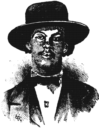
LEWIS SHERRARD LEARY.

says, that Lewis S. Leary "was mortally wounded early on the 17th, "at the rifle factory, and died in a cooper's shop on 'the Island.'" He suffered great agony, but was left alone by the infuriated defenders. Of the circumstances attending the death of Dauphin Thompson, little is known, except that he was shot outside and died in the engine-house. Steward Taylor