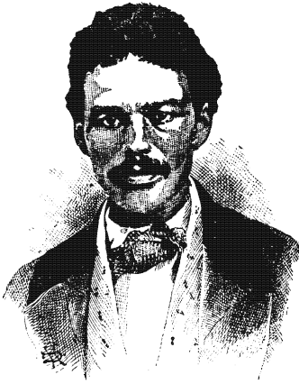
JOHN A. COPELAND.