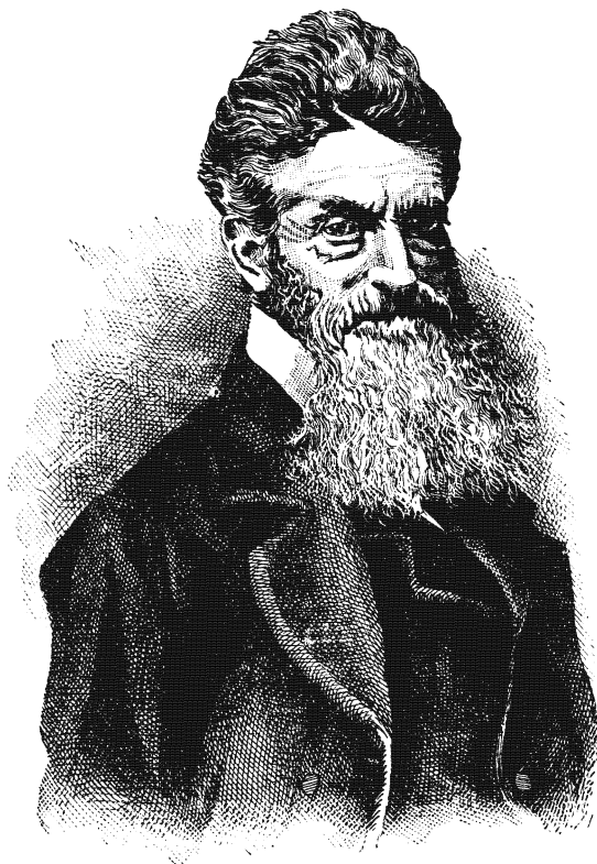
JOHN BROWN AT THE AGE OF 58.

led the general advance across the northern line of Kansas from Nebraska, appeals had been made that