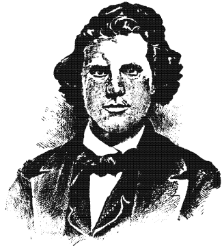
DAUPHIN ADOLPHUS THOMPSON.