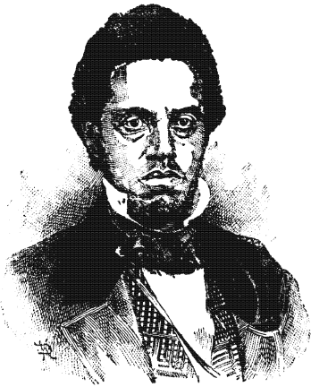
OSBORNE PERRY ANDERSON.

days that followed the 17th of October, 1859. In subsequent conversation with Charles Plummer Tidd, while in northern Ohio, and later with Barclay Coppoc in Boston and at North Elba, the following July, I had my view strengthened into conviction, that the final order to move was based upon a sudden emergency. Osborne Perry Anderson's graphic and in-