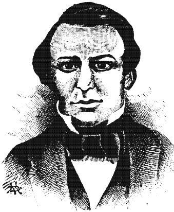
JOHN HENRI KAGI.

the force went on and into the Arsenal grounds. Watson Brown and Stewart Taylor were placed as guards, and the engine-house was then occupied. The watchman in the armory began to shout and would not open the door, which was forced. The two prisoners were left under charge of Jeremiah G. Anderson and the younger Thompson. Stevens then moved to take possession of the armory. Kagi and Copeland