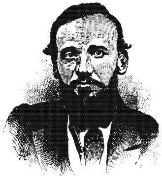
AARON DWIGHT STEVENS.

On John Brown's arrival at Tabor, in the middle of August, Henry and William Thompson, with Salmon and Oliver Brown, started at once for their Adirondack homes, glad to get away from war's disorder. For a considerable period thereafter, they were disinclined to proceed any further in their leader's course. On the second trip north, Captain Brown and party camped near or passed the lines of