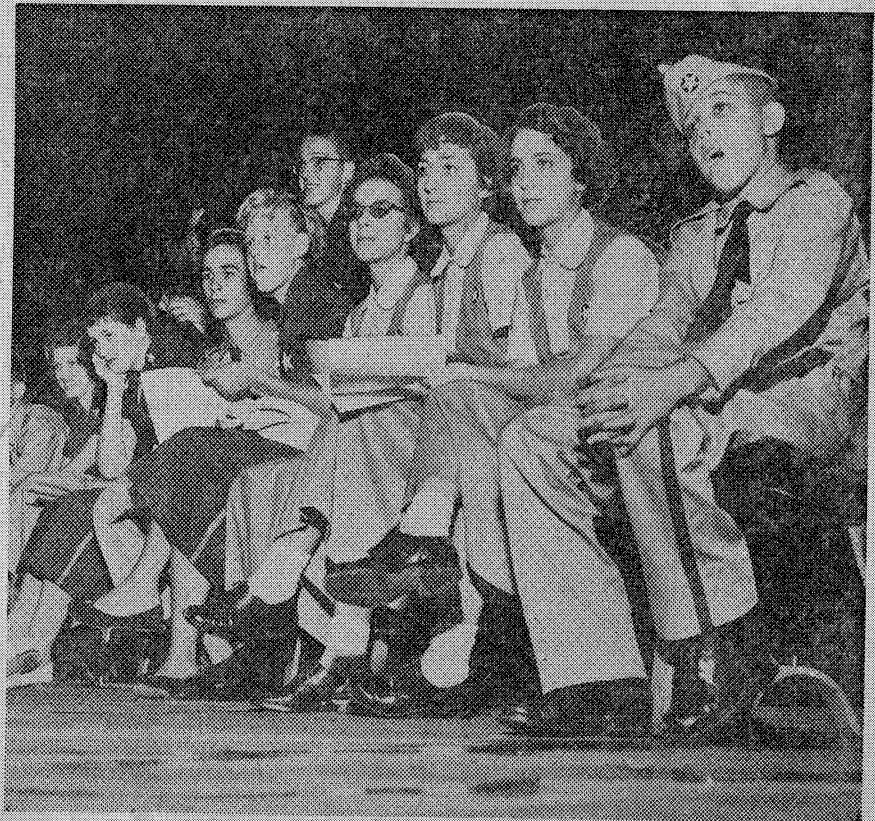
WHAT THEY THOUGHT OF OUR AQUACETTES IS PLAIN on the smiling faces of the young guests as they sat by the pool watching. A 14-float pageant is carded with tomorrow's bust-unveiling. The Cubans fly home Saturday.