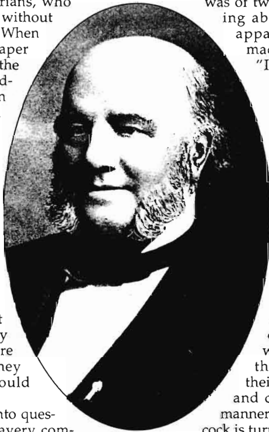
Samuel C. Pomeroy, a "well known Free State Yankee," purchased the Squatter Sovereign in 1857.

Allegations like these called into question the New Englanders' antislavery commitments. "Abolition philanthropy is about the cheapest commodity the market affords," claimed an Illinois newspaper cited by the Squatter Sovereign . "An Abolitionist will be the most humane, benevolent kind hearted fellow in the world, if it isn't likely to cost him anything. But just ask him to fork over half a dollar to buy a beef-stake for one of the negroes he professes to pity so much, and he'll squeak out like a cart-wheel that hasn't seen tar for a month." 31