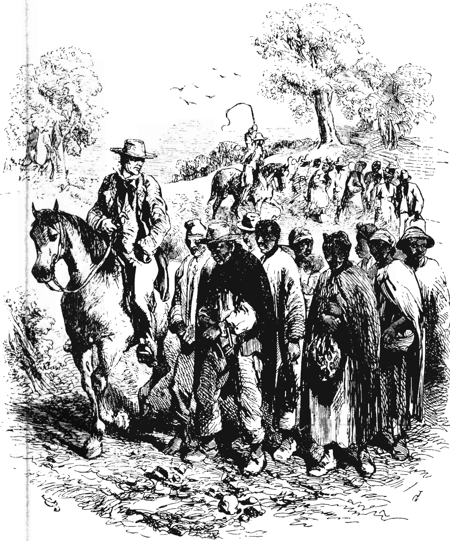
The slavery issue was pushed westward as southerners sought new territories in which to further their cause.