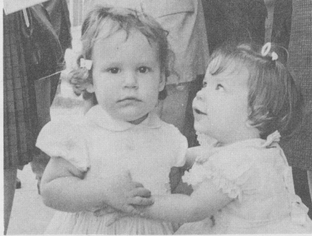
... The newcomer here gazes up wonderingly at adult newcomers in the community of resettlement, while the American child greeting her is momentarily distracted by the camera.

REFUGEE CENTER REGISTRATIONS TOP 128,000 (July 15, 1962) Refugees registered 128,640 Refugees resettled 34,144 Weekly arrivals from Cuba 1,500-2,000 Weekly resettlements 800-1,100 (Refugees have resettled in 49 states and have gone to Puerto Rico, Virgin Islands, & 20 foreign nations.) U.S. cities resettling refugees near 900 Cities outside Florida resettling over 100 34 Refugees now in Miami about 88,000