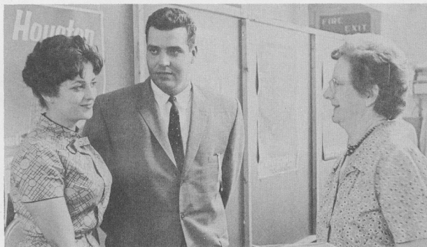
... A young couple, the husband legally trained, conclude their interview about resettlement. He is ready to "take anything" to make a new start, in freedom.

Two shoe factory presidents in Lowell, Mass., have made possible a "job assured" resettlement project. They set up training courses and admitted to them 22 men and women who took aptitude tests at the Cuban Refugee Center and were found to be qualified to learn shoemaking techniques. Thirty-one persons, including children, were flown to Massachusetts, in two groups, each with a bilingual Cuban spokesman capable of interpreting for his fellow workers. The project was proposed to the Refugee Center through the Massachusetts Governor's Commission For Refugees.