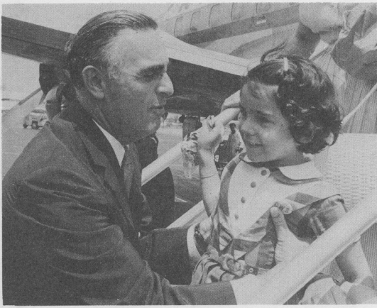
... A young refugee smiles as she arrives with her family in the community of resettlement ... It is Washington, D.C., and greeting her is former Secretary Ribicoff, of the Department of Health, Education, and Welfare, who first administered the Cuban Refugee Program under a directive from President Kennedy. Anthony J. Celebrezze, has succeeded Mr. Ribicoff as HEW Secretary and administrator of the program.

REFUGEE CENTER REGISTRATIONS TOP 128,000 (July 15, 1962) Refugees registered 128,640 Refugees resettled 34,144 Weekly arrivals from Cuba 1,500-2,000 Weekly resettlements 800-1,100 (Refugees have resettled in 49 states and have gone to Puerto Rico, Virgin Islands, & 20 foreign nations.) U.S. cities resettling refugees near 900 Cities outside Florida resettling over 100 34 Refugees now in Miami about 88,000