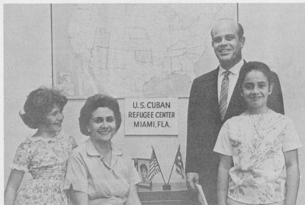
... Happy at the thought of a new home at some point on the map behind them, this family consults at the Refugee Center. The husband and father is a lawyer who has temporarily worked as a hotel bellboy in Miami.

(A Cuban Refugee)