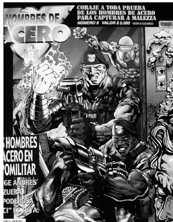
Democratic Security covers all bases: comic books, cartoon shows, a website, school appearances, and other psyop products have been deployed to win over Colombia's newest generation.

Eliminating the "strategic rear guard" is crucial. There is a common misconception that "guerrillas" are self-sustaining, obtaining all they need either by