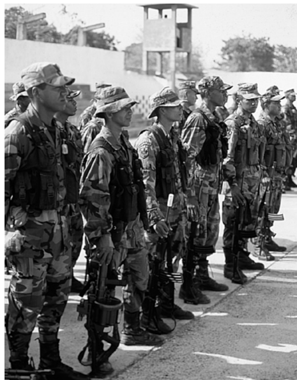
A local-forces platoon, part of the Home Guard that has been key to Colombia’s successful COIN approach, prepares for an inspection prior to a mission.

But in the absence of local forces, which had fallen afoul of constitutional court restrictions and thus were disbanded, it was difficult to consolidate gains. As areas were retaken, they could not be