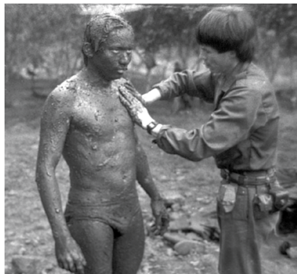
In this captured photo, a FARC sapper applies natural camouflage. FARC sappers have in the past been trained by Vietnamese, Cuban, and FMLN operators. They specialize in infiltration attacks.

FARC's vulnerabilities had been recognized by the new military leadership that emerged following Pastrana's inauguration. They had crafted their