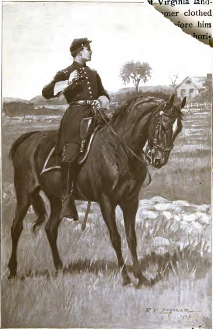
In front of him stood the old Virginia homestead.—Page 67.

of Virginia land- mer clothed fore him hori-