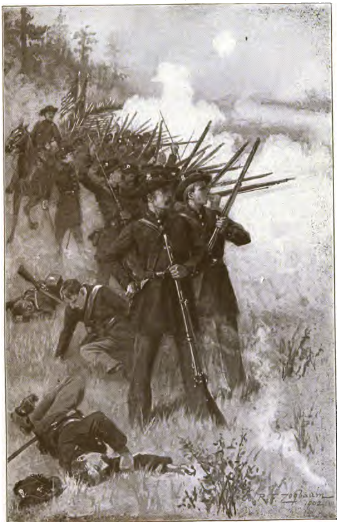
The rifle-butts leap to the shoulders.—Page 222.