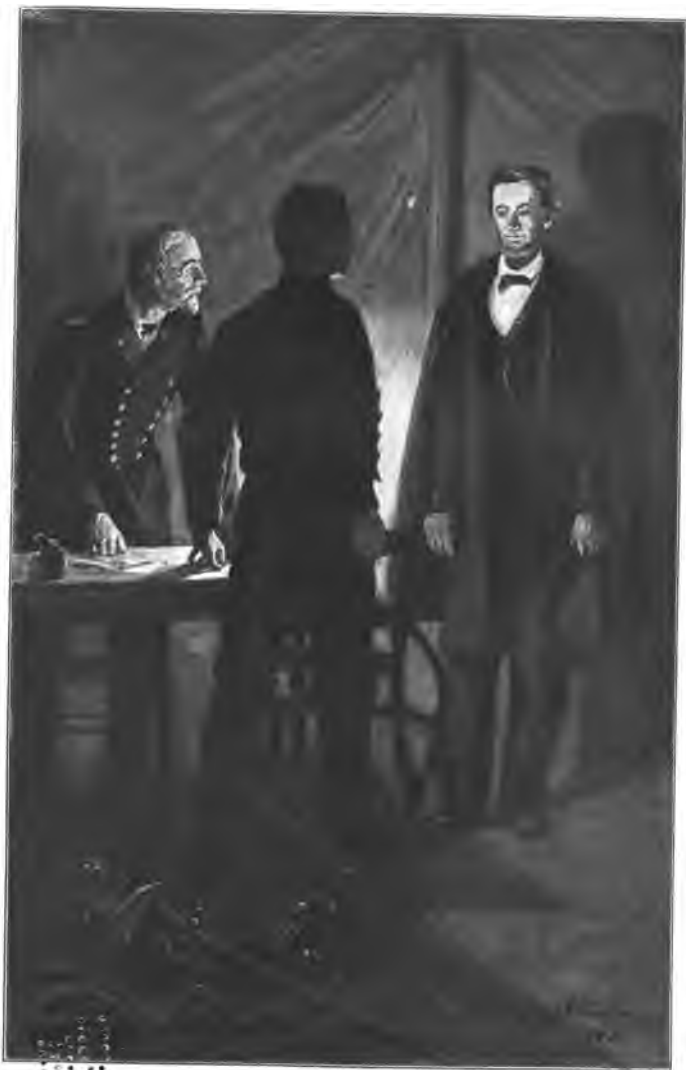
"It is I—Abraham Lincoln." Frontispiece.—Page 240.