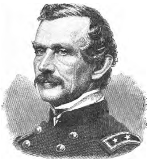
TAKEN DURING THE WAR, WHEN ABOUT 52.

"AN Utility General." "The best of them all, after all." "The only engineer officer who had go ahead in him and did not think all the time of digging."— A Veteran Officer of the New and Old World.