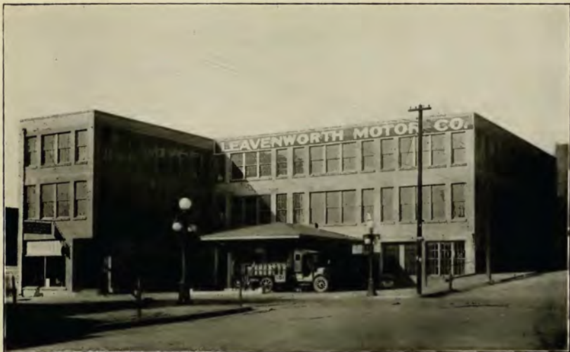
LEAVENWORTH MOTOR COMPANY