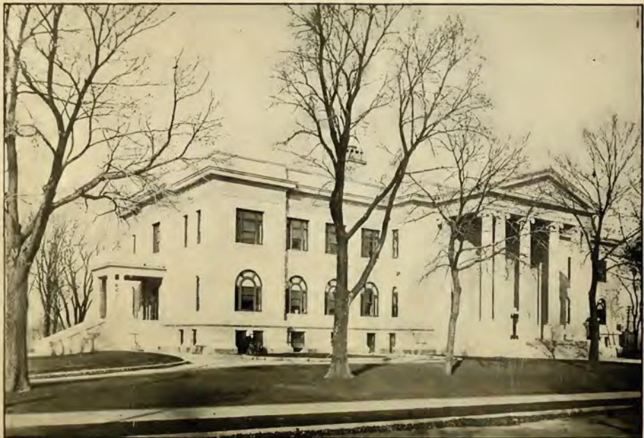
LEAVENWORTH COUNTY COURT HOUSE