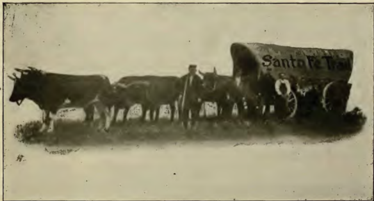
EARLY DAY TRANSPORTATION