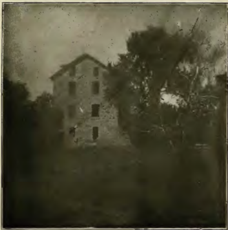
THE JACOB RAPP GRIST MILL.