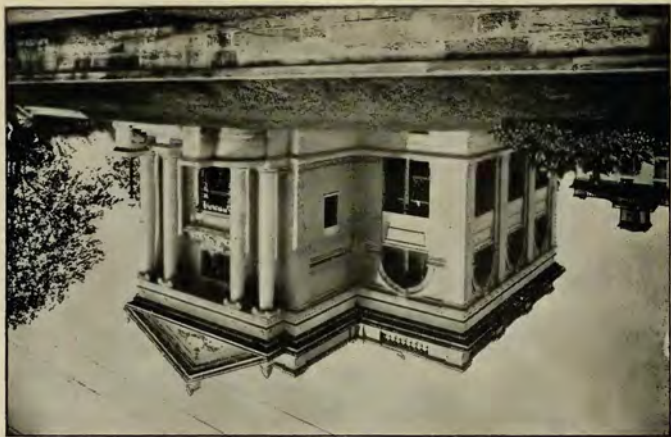
PUBLIC LIBRARY, LEAVENWORTH, KANSAS