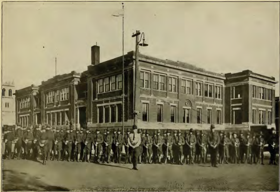
LEAVENWORTH HIGH SCHOOL AND CADETS