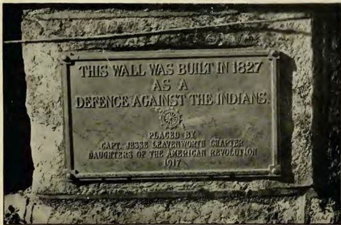
MARKING THE BEGINNING OF FORT LEAVENWORTH