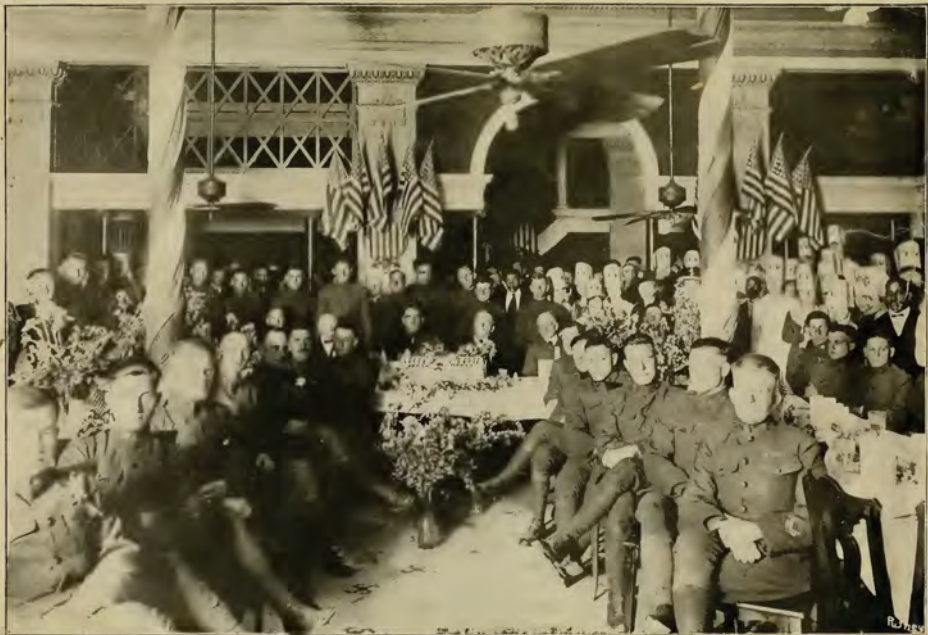
BANQUET TO THE RETURNING LEAVENWORTH COUNTY WORLD WAR VETERANS