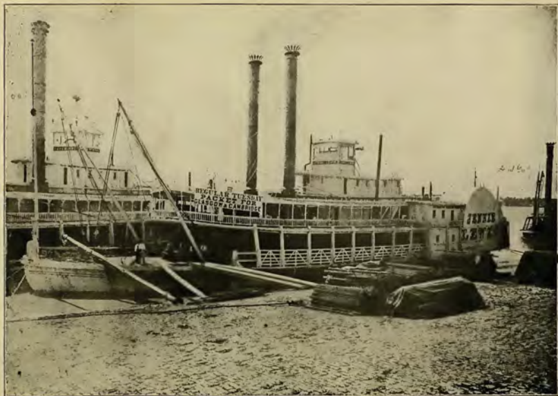
STEAMBOATING ON THE MISSOURI IN 1860