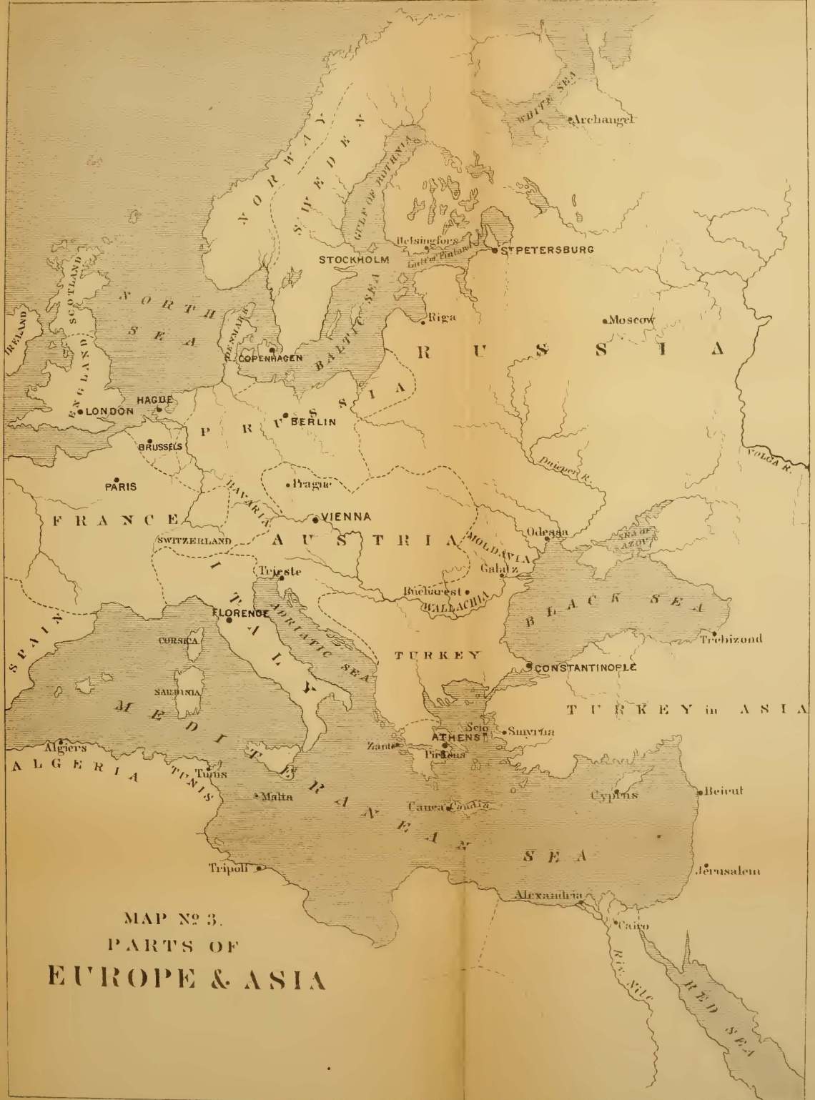
MAP No 3. PARTS OF EUROPE & ASIA

Diplomatic Posts are written thus VIENNA, Consuls General & Consuls are written thus Prague.