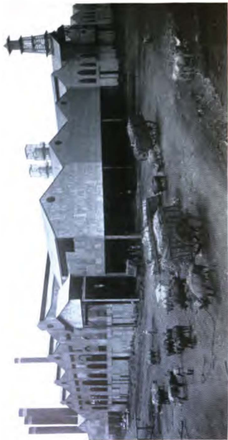
A TYPICAL CUBAN SUGAR MILL—NOTE THE OX-DRAWN CANE CARTS