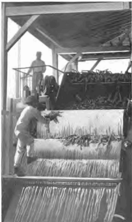
CANE CRUSHING IN CUBA