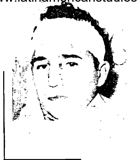
— Castro without beard.

-IN THE FIRST SIX MONTHS CASTRO'S REGIME VIOLATED THE ASYLUM TREATIES SIGNED WITH DIFFERENT LATIN AMERICAN COUNTRIES.