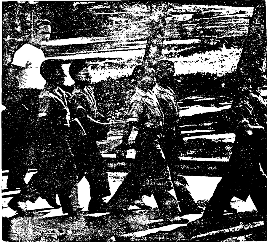
Children marching through the streets of Havana. The future of the young people of Cuba is very dark, unless.....