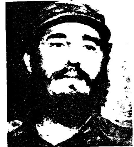
-Castro with beard.

Fidel Castro's two faces. Only one purpose : CRIME.