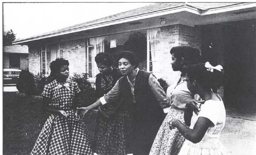
Daisy Bates and some of the Little Rock Nine, ca. 1957. (photo, page 3) Daisy and L.C. Bates examine burned cross in their front yard, ca. 1959.

The month following the nine's entrance into the high school, Bates and others associated with the NAACP were arrested. Bates voluntarily surrendered herself to the police and was released on bond. They were charged with violating the Bennett Ordinance