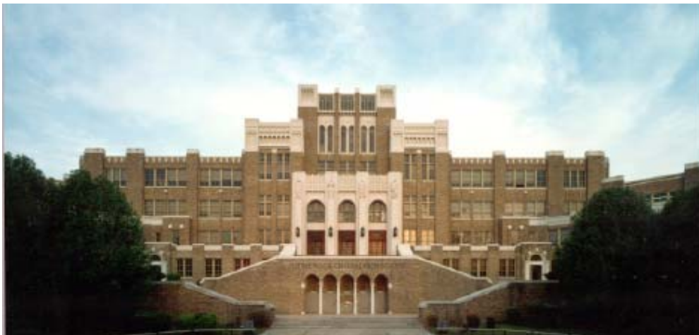
Little Rock Central High School.

**Thurgood Marshall is specific to Little Rock Central High School history; Warriors Don't Cry was written by Melba Pattillo Beals, one of the Little Rock Nine; Little Rock: The Desegregation of Central High School is relevant to the crisis at Central High School in 1957; The Long Shadow of Little Rock was written by Daisy Gatson Bates, a mentor to the Little Rock Nine. All of these books are available in your local library or at Little Rock Central High School National Historic Site at 501-374-1957.