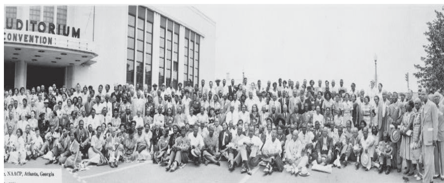
Annual meeting of the NAACP, Atlanta, Georgia, ca. 1940.