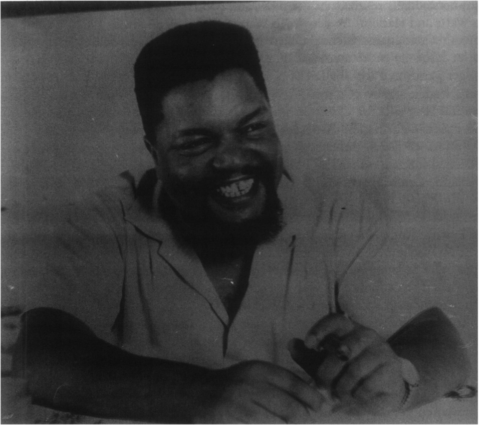
A gleeful Robert F. Williams smokes a cigar in celebration of his safe passage to Havana, Cuba, after escaping from a massive Federal Bureau of Investigation (FBI) dragnet in 1961.