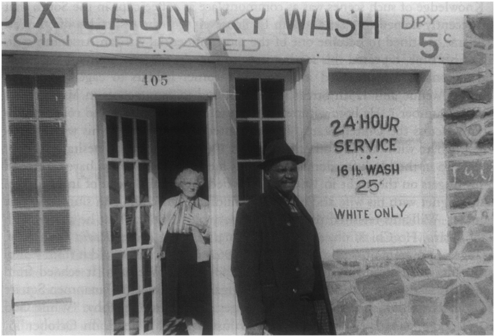
Unidentified African American man in front of a “white only” laundromat, Monroe, North Carolina, 1961. In the South where Robert F. Williams grew up, black maids washed the bodies of aged and infirm white people, but the uniforms that they wore could not be laundered in the same machines that white people used.